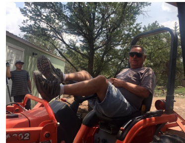
Plumbing the Bunkhouse!