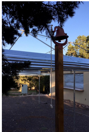
Dinner Bell @ Camp Kitchen!