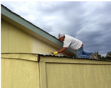
Painting High & Low!