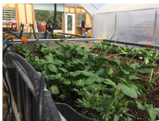
For several days TRI Headquarters was busting with activity! Every where you looked things were happening!