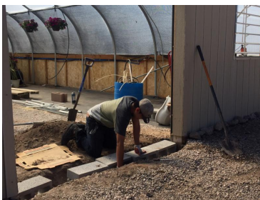
Greenhouse Threshold & Interior Pest Barrier