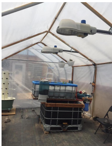
Aquaponics Room with lights to extend the growing season.

"Behold, a sower went forth to sow; And when he sowed, some seeds... [landed in TRI's Aquaponics grow-bed!]"