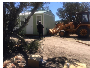
Moving Bunkhouse in Place