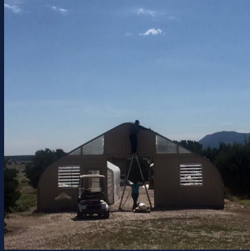
Securing the Wire-lock