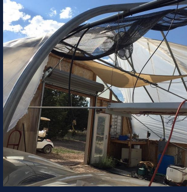
View from Inside