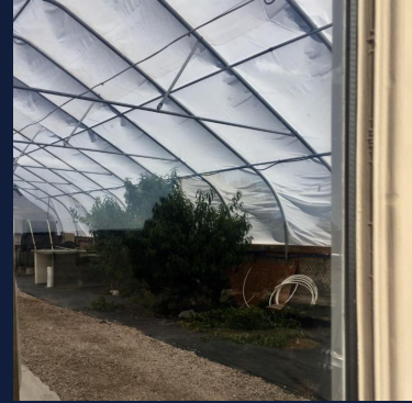
New Inside View