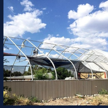
Exterior View of Frame