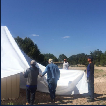
The New Cover