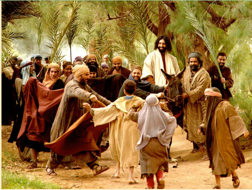
Tradition had Jesus going to Jerusalem on Sunday (Palm Sunday) dying on Friday (Good Friday) and being raised on the following Sunday (Easter).

Jesus said, "...Three days and three nights."